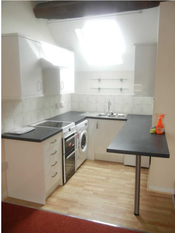
Installed kitchen in new flat

The tenant who had been allocated the property was then able to move into their new home.