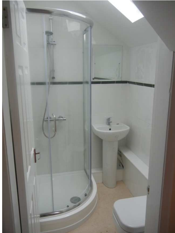
Newly created shower room