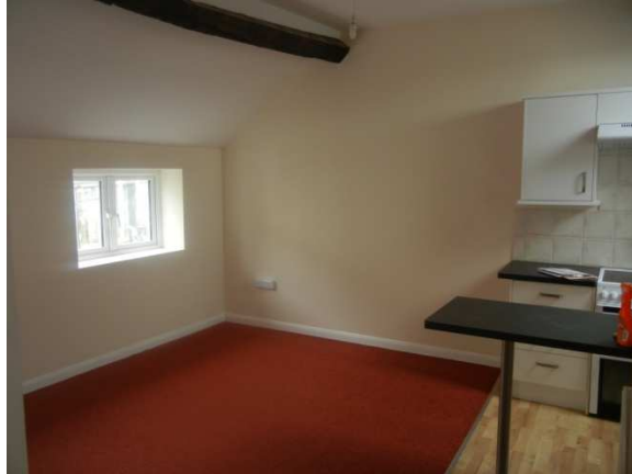
Living area of new flat

The owner had bought an empty commercial premise to provide a larger business space for themselves and they were very keen on creating, from the space above the shop, a one bedroom residential unit to provide a much needed home for a local person.